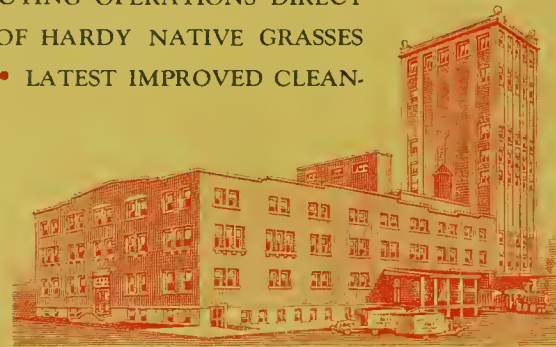
ASSEMBLING, CLEANING AND STORAGE PLANT ATCHISON, KANSAS

St. Louis—hub of trunk railroad lines to all parts of country. Served by numerous interstate truck lines. Low rates—quick service. Carlot, truckload or bag lot orders handled to your satisfaction